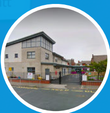
Thames Primary Academy Severn Road, FY4 1EE

We also work closely with 6 partner schools: