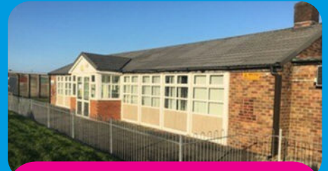
Whiteholme Youth Centre All Saints Rd, FY5 3AL