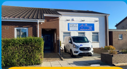
Grange Park Youth Centre 170 Horsebridge Road, FY3 7EA