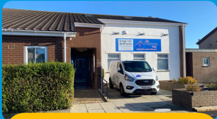
Grange Park Youth Centre 170 Horsebridge Road, FY3 7EA