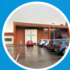
Christ the King Catholic Academy Rodwell Walk, FY3 7FC