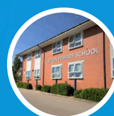
Layton Primary School Meyler Ave, FY3 7DX