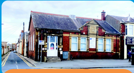
Bloomfield Youth Centre 205 Lytham Road, FY1 6ET