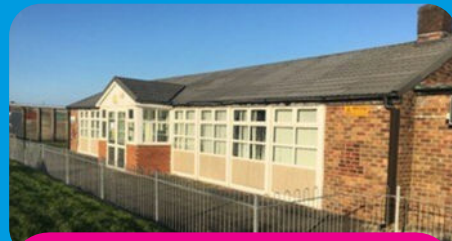
Whiteholme Youth Centre All Saints Rd, FY5 3AL