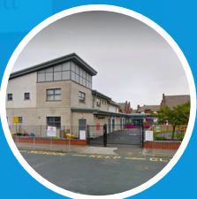
Thames Primary Academy Severn Road, FY4 1EE

We also work closely with 6 partner schools: