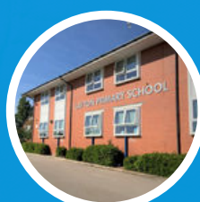
Layton Primary School Meyler Ave, FY3 7DX