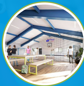
Fleetwood Youth Centre Highbury Road, FY7 7DJ

We also work closely with 6 partner schools: