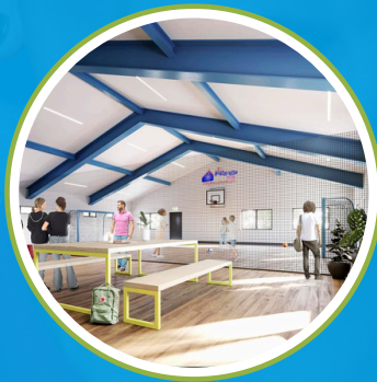
Fleetwood Youth Centre Highbury Road, FY7 7DJ

We also work closely with 6 partner schools: