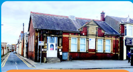
Bloomfield Youth Centre 205 Lytham Road, FY1 6ET