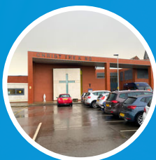
Christ the King Catholic Academy Rodwell Walk, FY3 7FC