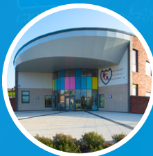
Blackpool Gateway Academy Seymour Road, FY1 6JH