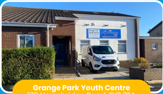
Grange Park Youth Centre 170 Horsebridge Road, FY3 7EA