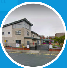
Thames Primary Academy Severn Road, FY4 1EE

We also work closely with 6 partner schools: