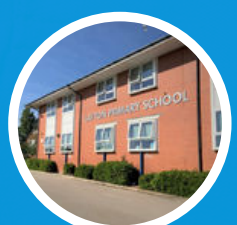
Layton Primary School Meyler Ave, FY3 7DX