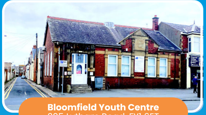
Bloomfield Youth Centre 205 Lytham Road, FY1 6ET