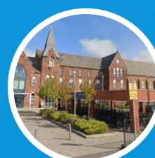
St Mary's Catholic Academy St Walburgas Rd, FY3 7EQ