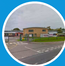
Boundary Primary School Dinmore Avenue, FY3 7RW